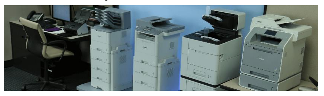
Figure 4: A4 Print Devices Pod

Print technology can also achieve productivity through performance. For example, the most productive devices are reliable, fast, and consistent. They have a simplicity and robustness of design that helps protect against breakdowns.