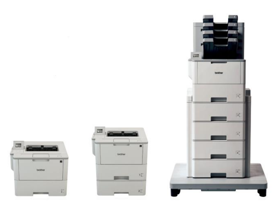
Base Model with w/up to 250 sheet capacity