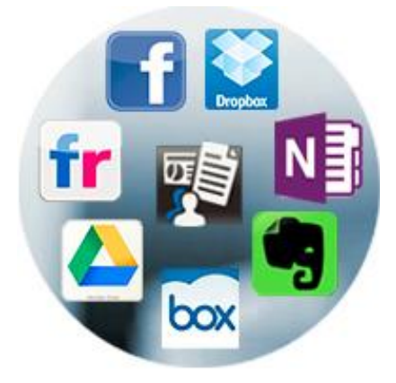
Figure 6: Cloud Services Connected to Select Print Devices

The best mobility solutions are also defined by their compatibility across print devices and mobile operating systems. The price or class of the device does not matter, demonstrating that the vendor is committed to enabling mobile functionality for all users. This is a compelling value proposition that distinguishes these kinds of portfolios from certain competitive offerings.